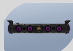
Cylindrical Evolution Sound Bar