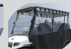
Optional All-Weather Enclosure