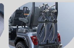
Optional Golf Bag Holder